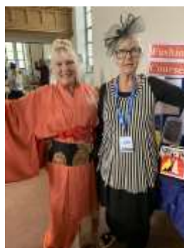
Fashion is Fun