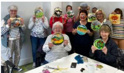
Wool felting landscapes